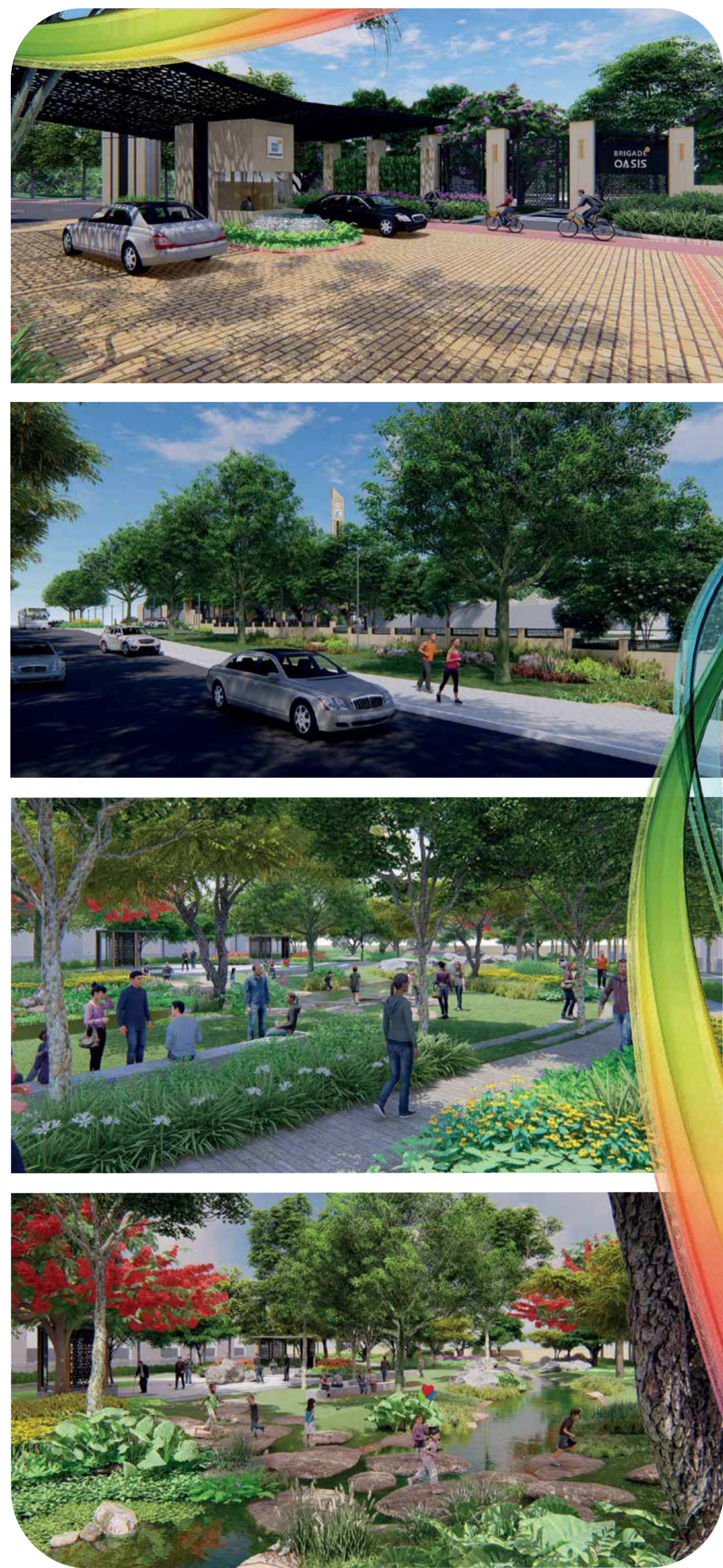
Artist's Impressions Disclaimer: All materials shown are indicative only